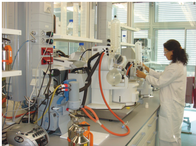
Fig. 2. The ICIQ houses 26 research laboratories, 12 research support laboratories, and 4 technology rooms.