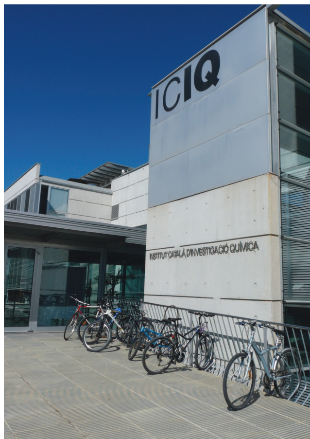
Fig.1. Entrance to the Institute of Chemical Research of Catalonia (ICIQ) facilities.

In terms of research output, between March 2004 and May 2010, the ICIQ published more than 600 scientific papers, reaching an h-index of 50. Additionally, a total of 24 patent applications were filed.