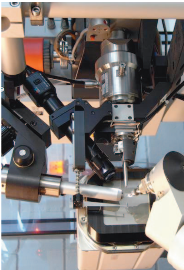
Fig. 3. A single crystal X-ray diffractometer in the X-ray diffraction unit laboratory.